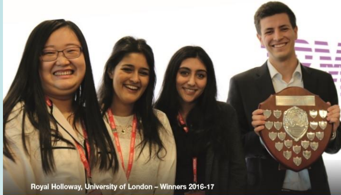
Royal Holloway, University of London – Winners 2016-17