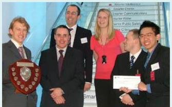
Aston University: Winners in 2009-10