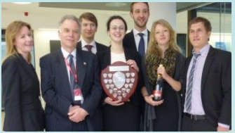
Anglia Ruskin University: Winners in 2011-12