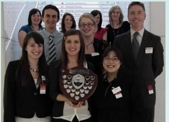
Bournemouth University: Winners in 2010-11