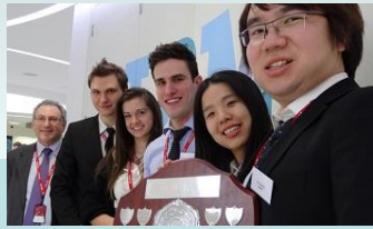
University of Essex: Winners in 2012-13