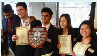
University of Sheffield: Winners in 2014-15