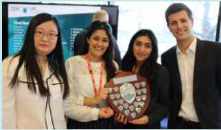
Royal Holloway Winners in 2017-16