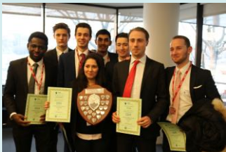
University of Bristol Winners in 2015-16