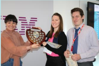
Anglia Ruskin University: Winners in 2017-18

The 3 round format starts the last week in October and ends the last week in March the following year